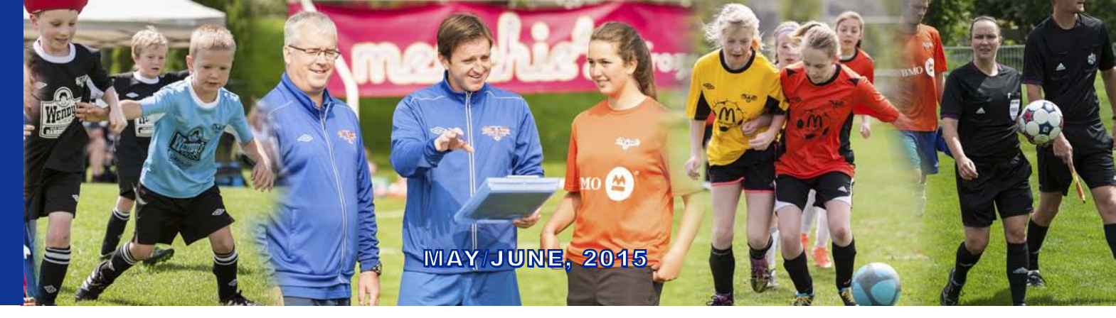
A bi-monthly publication of the Kamloops Youth Soccer Association